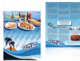
1 or 2 Sided

To-Go Menus Are printed in one color on white or cream colored 28# uncoated stock. Choose from black, blue, or burgundy ink.